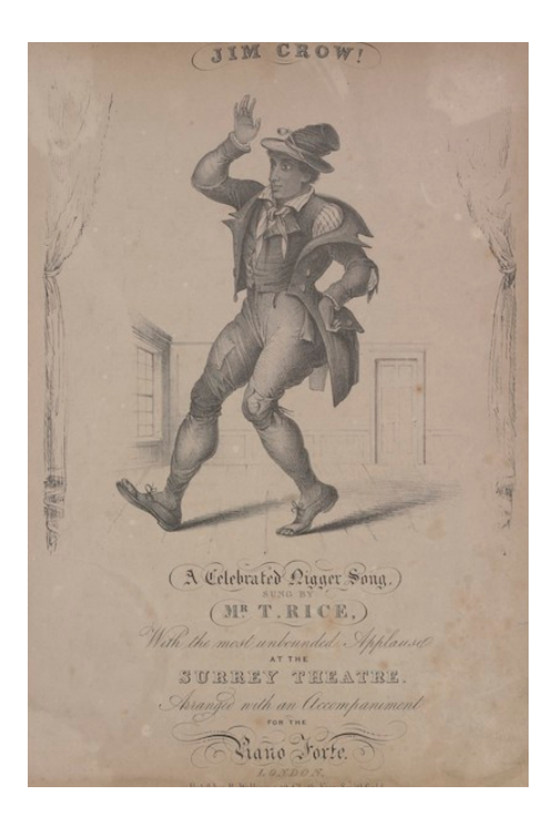
Figure 1. Front cover of the music sheet for "Jim Crow!, The Celebrated Nigger Song," sung by T. D. Rice at the Royal Surrey Theatre in London, 1836.

On the Victorian stage, Friday's slave identity meant he could appear in the American minstrel fashion while still being a figure of pity for Crusoe. In Henry J. Byron's 1860 Robinson Crusoe! Or Harlequin Friday, and the King of the Caribee Islands! Crusoe rescues Friday and they have their first exchange: