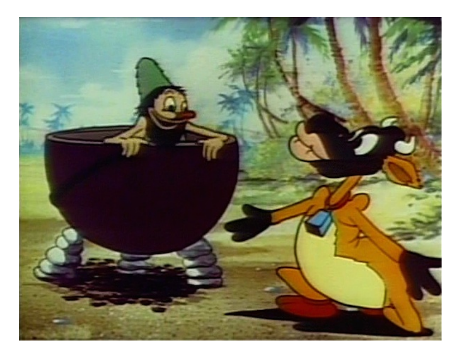
Figure 5. Molly Moo Cow/Friday echoing Jolson in the Mammy pose. Still from cartoon in the public domain.

The uniting factor in all three cartoons lies in the appearance of the cannibals. In all three, the cannibals are the same species/race as Friday, dressed only in skirts and decorated hair pieces (bones, feathers) and throwing spears. The cannibals come en masse , with weapons, to eat Crusoe, but he and/or Friday outwit the hordes to escape the island. If Friday is the minstrel in the cartoons, the savages are the Other on display. Or perhaps, more accurately, the imagined Other. Whereas in World's Expositions the non-white cultures exhibited were real people (though posed or staged to a certain extent), the cartoonists took a broad-spectrum image of Africans to present stereotyped savages. The bones in the hair, the nakedness, the dancing around a cauldron turned the cartoon savage into an object of immediate recognition, perpetuating a popular conception of how primitive natives looked and acted. These exaggerated and inaccurate racial markers and the cannibals' failure to defeat Crusoe further turned the savage into an object of ridicule. The medium of the cartoon film insured the propagation of these values and racist assumptions to mass audiences in America and internationally.