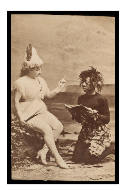
Figure 2. Lydia Thompson as Robinson Crusoe and Willie Edouin as Man Friday in Robinson Crusoe at the Folly Theatre, 1876.

portrays Crusoe as the figure with power and authority, Edouin portrays Friday as childlike. The racial markers, the nakedness/blackness, and the physical subservience became recognisable traits of Friday in subsequent productions.