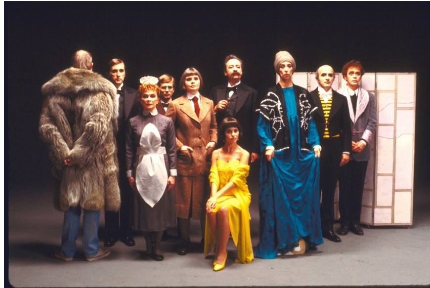
Figure 3. Edward Gorey and the cast of Gorey Stories.

The costumes for Dracula and Gorey Stories are similar in that they both indicate style and period, but where Dracula 's costumes for Lucy and Reinfeld communicated what was happening to the characters in the story, the costumes for Gorey Stories (Figure 3) provided versatility as all the actors play various characters throughout the evening, and their costume corresponds with the types of roles they will be portraying. The script lists the character names along with the kind of stock characters they will be playing. Those types include a maid, a butler, the hostess, a spinster, a singer, a child, an opera fan, an author, and a young man. 51 The costumes provide utility for the actors and actresses to play all the types in the Gorey canon, as well as present a Goreyesque aura as they performed the various stories and poems throughout the evening.