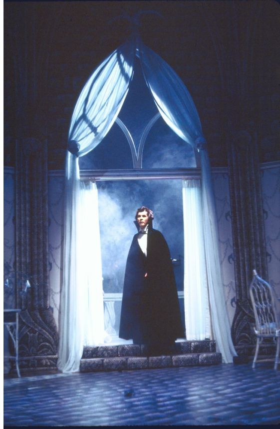
Figure 1. Frank Langella as Dracula.

The next autumn featured another Gorey production on Broadway. On October 17, 1978 Gorey Stories began previews. Coined as “An Entertainment with Music” the 90-minute play featured enactments of seventeen of Gorey’s short books with musical accompaniment and a cast of 5 men and 4 women. The production officially opened, and closed, on October 30, lasting only one performance and sixteen previews.