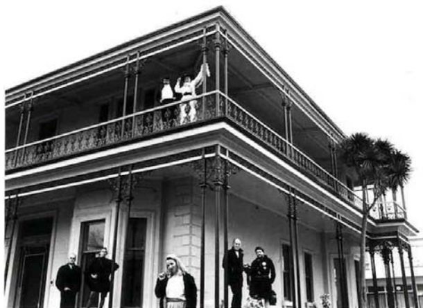
Figure 4. TheatreWorks actors prepare for a cultural re-occupation of the building in 1986.