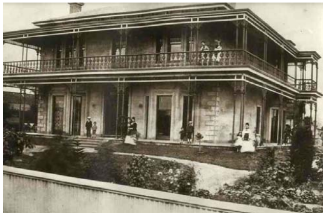
Figure 1. Members of the Michaelis family pose for a photograph outside the building circa 1900.

of the great Victorian gold rush. Because of an upper class British faith in the efficaciousness of sea air, St. Kilda in the late-19 th century had become the wealthiest suburb in Melbourne and home to a burgeoning 'squattocracy' – a colonial elite whose wealth derived principally from the occupation of prime agricultural land, often with questionable legitimacy.